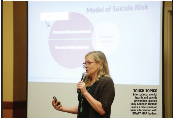
TOUGH TOPICS International mental health and suicide prevention speaker Sally Spencer-Thomas leads a discussion on crisis intervention with SMART MAP leaders.

A national training program in the International Association of Sheet Metal, Air, Rail and Transportation Workers union is helping sheet metal workers tackle issues of mental health, substance abuse and suicide prevention at a local level.